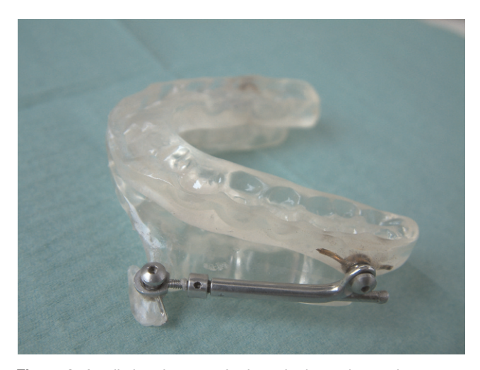
Figure 2. Acrylic breakage on the lateral telescopic attachment.

The results of this study suggest that 5 years of MAD treatment did not modify TMD prevalence in OSA patients. This is the first study in which TMD was diagnosed according to the RDC/TMD and classified as myofascial pain, disc displacement, and TMJ arthralgia/arthrosis in OSA patients in long-term therapy with MAD. Furthermore, OSA patients initially diagnosed with TMD were not excluded from this study. Although it has been stated that active TMD is a